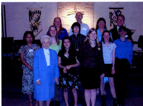
2005 Confirmands and Mentors

On Heritage Sunday, 2007, a confirmation class of four young people joined the church and were welcomed by twelve 50-year members at a potluck held in their honor.