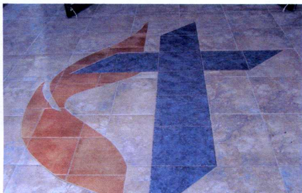
South Entryway Porcelain Tile

A magnificent carillon, given by the Sams family and the Paul Sams Memorial Fund, was first heard in the church and throughout the neighborhood on Easter Sunday, 2007.