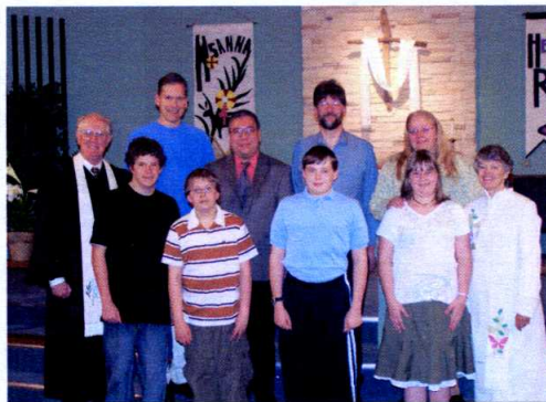
2007 Confirmands and Mentors